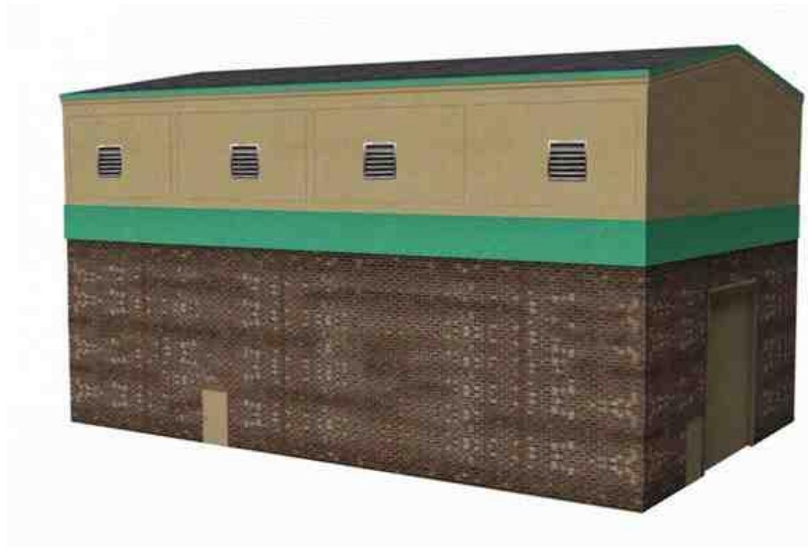
GIS Building Rendering