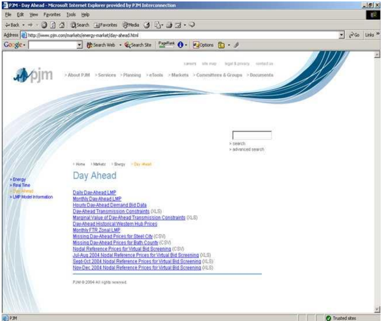
Figure 3 - PJM Day Ahead Market Results